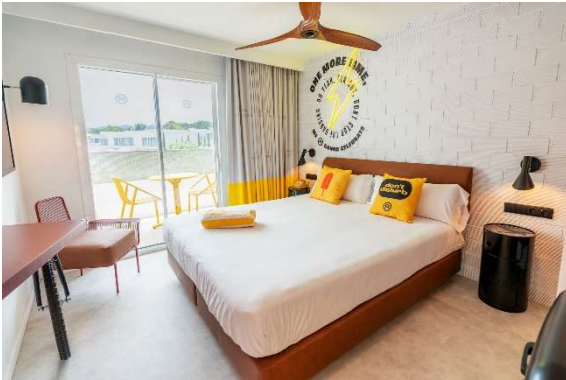
Superior Side Sea View