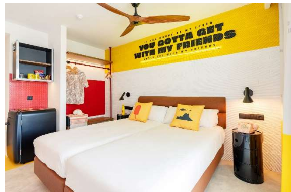
Superior Pool View