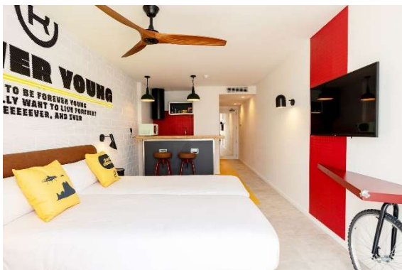
Studio Sea View