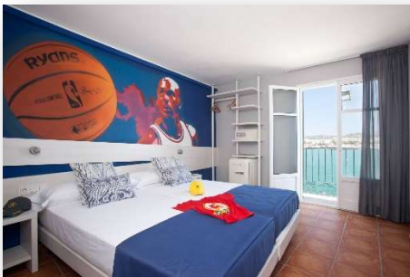
Premium Double Room Sea View