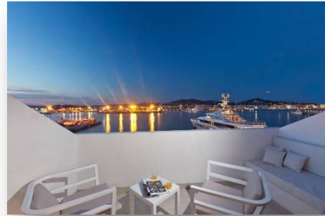
Premium Penthouse Sea View