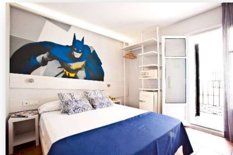
Premium Double Room